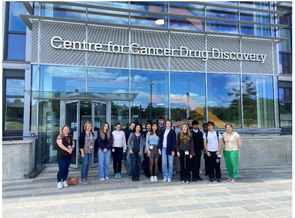
Sixth form students taking part in the Centre for Cancer Drug Discovery work experience week.

key experiences gained from the programme. 100 per cent of the students who attended agreed that their learning objectives for the programme were met with 93 per cent agreeing that they were going to study a science related qualification post school.