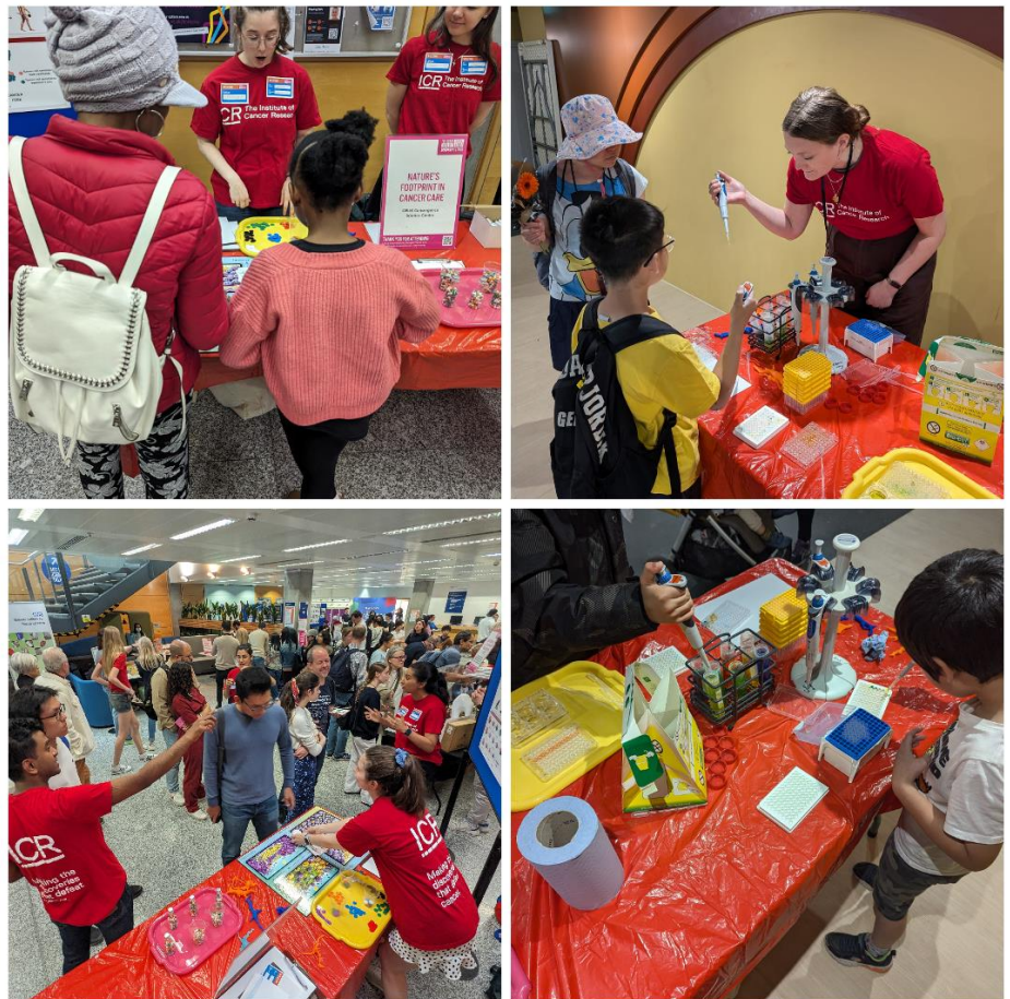
ICR staff and students engaging members of the public at the Great Exhibition Road Festival and Sutton STEAM Fair.

Our local communities have engaged with our researchers through several different events, festivals and opportunities. During the summer, a team of researchers took part in the Great Exhibition Road Festival in partnership with the Cancer Research UK Convergence Science Centre hosted at Imperial. Visitors of all ages were invited to try out the 'Cancer Evolution' board game trying to defeat the tumour using a combination of treatment and genetic change cards. It prompted conversations about why its important to understand cancer evolution and how we might use this knowledge to find more treatments in the future or make those that we have better. More than 600 people came to the stall and talked with our researchers.