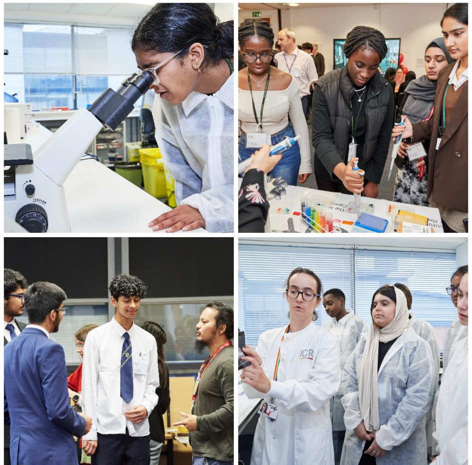
Sixth form students visit our laboratories in Chelsea and Sutton

The Careers in Research open evenings hosted at both of our Sutton and Chelsea sites have gone from strength to strength this year and have continued to work with schools in the local area to promote future diversity in science.